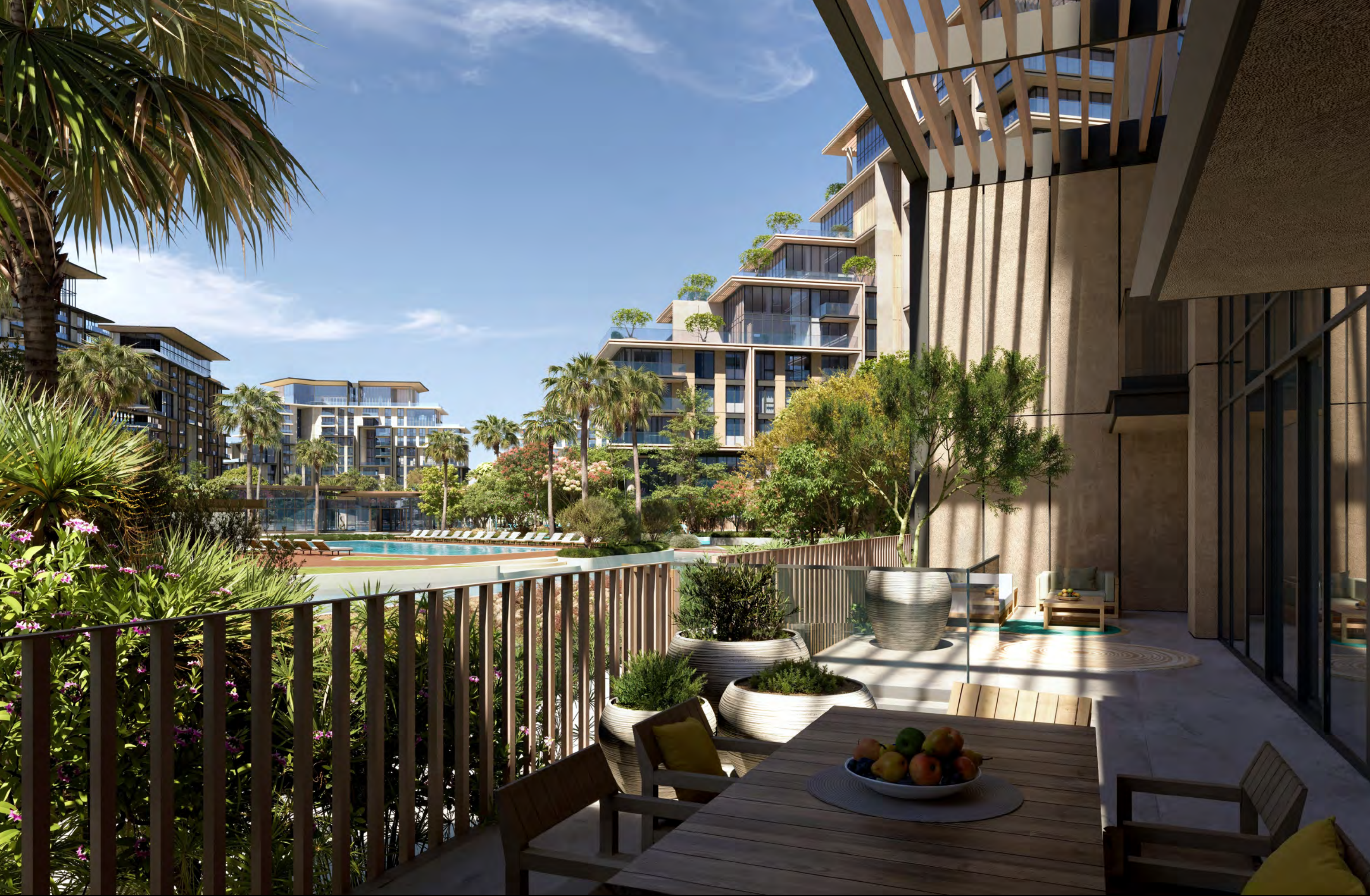
CRESTLANE 5 4-BEDROOM DUPLEXES