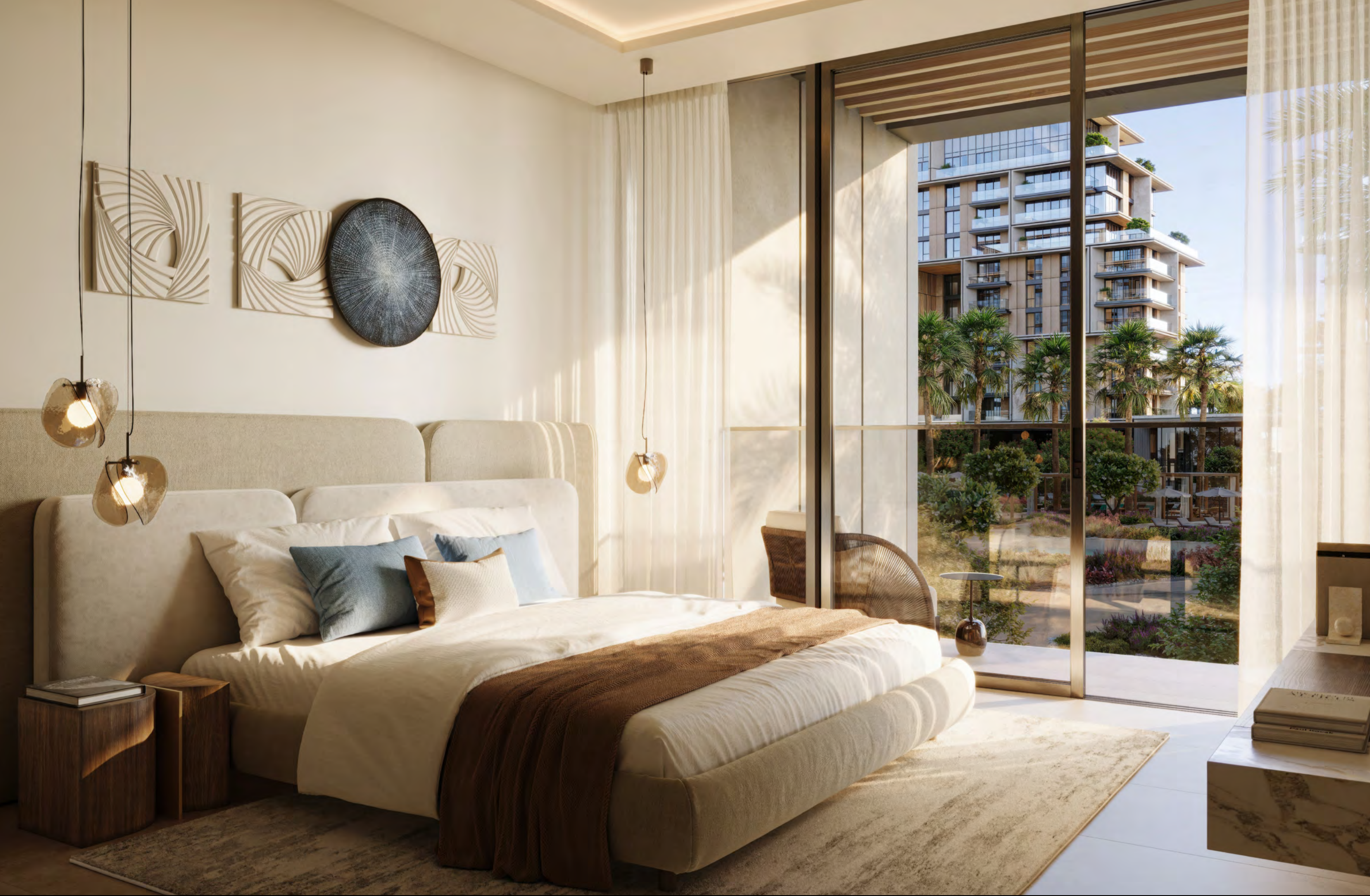
CRESTLANE 5 4-BEDROOM DUPLEXES