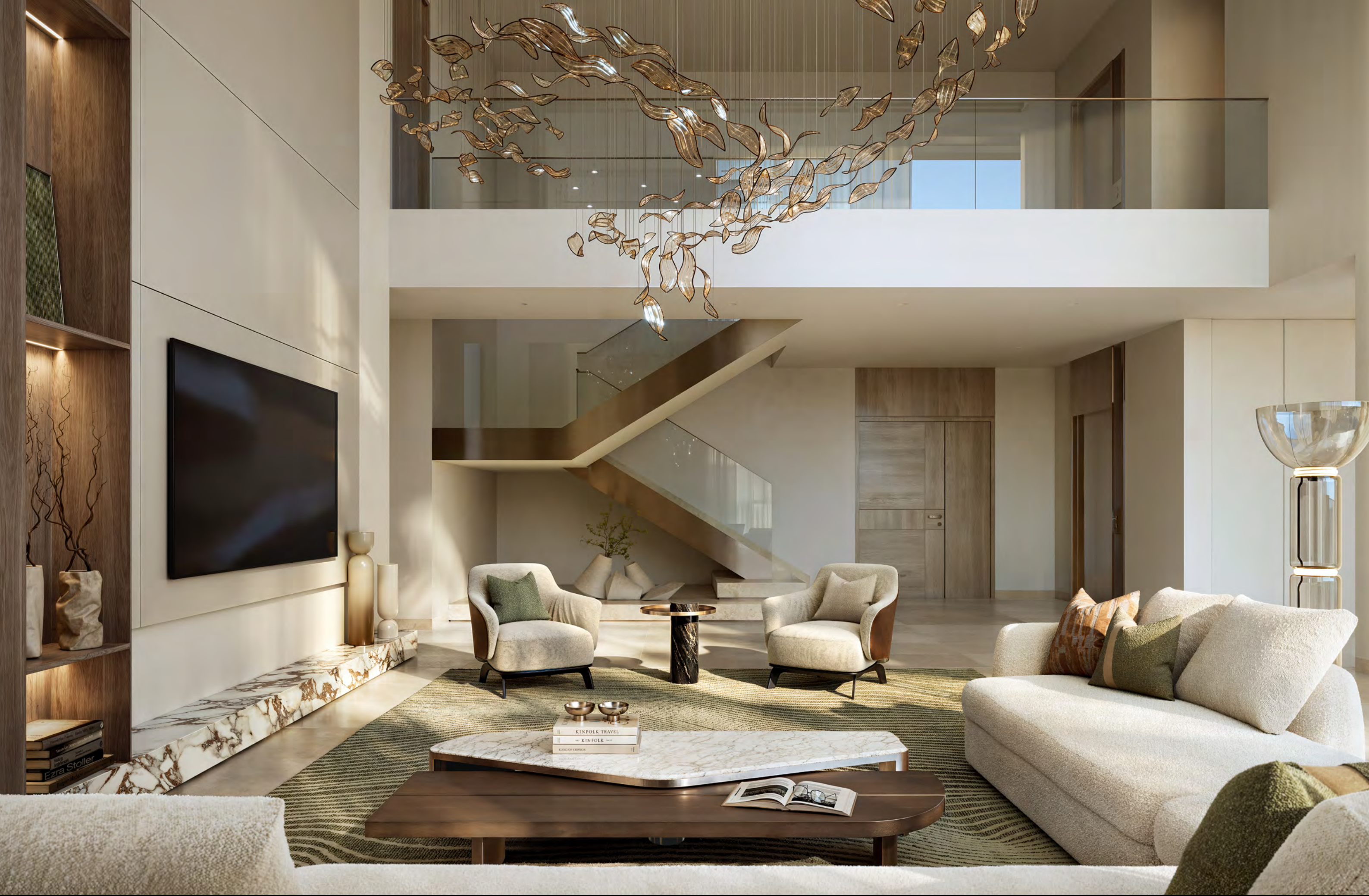
CRESTLANE 4 4-BEDROOM DUPLEXES