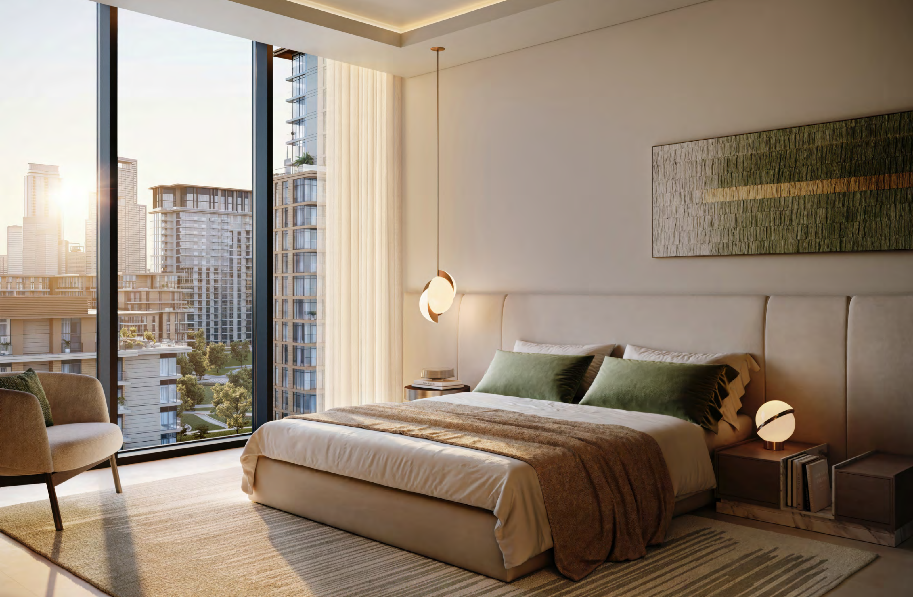
CRESTLANE 4 1 TO 3-BEDROOM