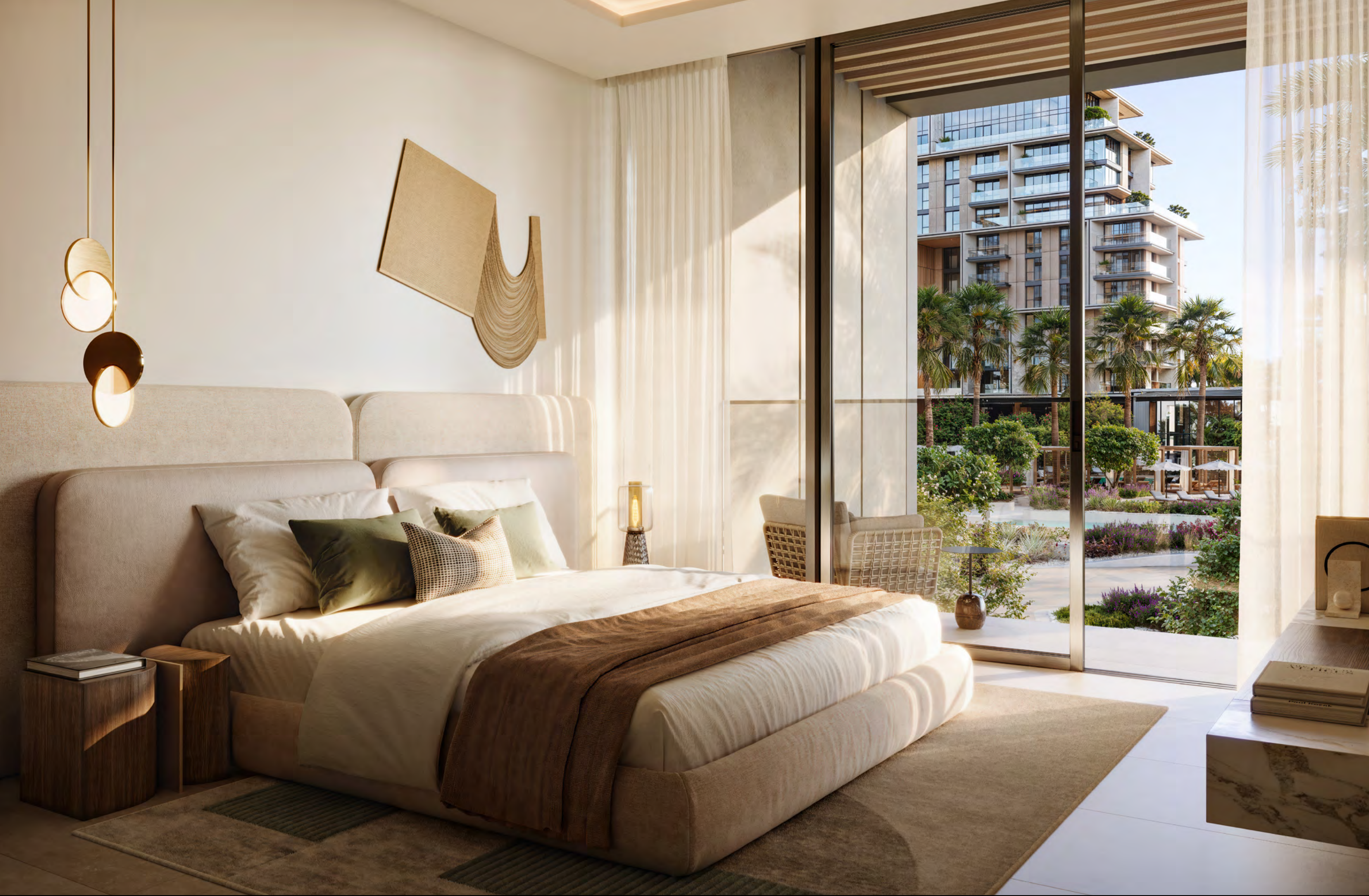
CRESTLANE 4 4-BEDROOM DUPLEXES